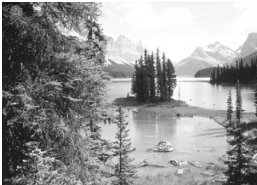
One of Dorothy Lynch's magnificent nature photos.

Hospice palliative care offers people and their families facing a progressive, advanced, life-threatening illness, individualized care which stresses dignity, comfort and support.