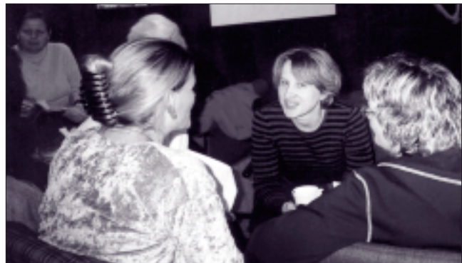
The Advanced Issues in Client Care workshop educates Etobians on end-of-life care, grief and bereavement support.

"Our team really benefited from this workshop in understanding how all of us contribute to the well-being of the patients," said one workshop participant. "I learned so much about understanding the emotional and physical needs of my dying clients," said another.