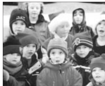
In December, "The Wainwright Carollers," ages two to 11, went door-to-door, entertaining their neighbours with songs of the season – and collecting $90 for The Dorothy Ley Hospice.

Want to add someone's name to the Seasons mailing list, or have your name removed? Simply e-mail/fax/mail your request to