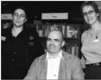
Book sales at our first-ever Night at Chapters event raises $1,600 for the Hospice.

a recent book about the Toronto Maple Leafs' 1967 series, who graciously donated his time to sign copies of his book for enthusiasts.