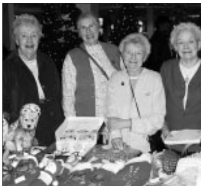
Time to get crafty: The Dorothy Ley Hospice Craft Club raised over $1,000 for Hospice.