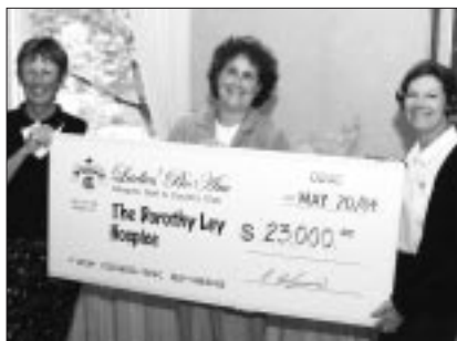
The Islington Golf & Country Club comes through again with the proceeds from another wonderful fundraising event.

Third party events made for a great summer. Helping Other People Everywhere (HOPE) raised $14,000 for us through an exciting day-long volleyball tournament at Centre Island, and two branches of the Bank of Montreal (Queensway and Kingsway) raised $3,000 by having a car wash/barbecue, and a Thanksgiving Bake Sale respectively.